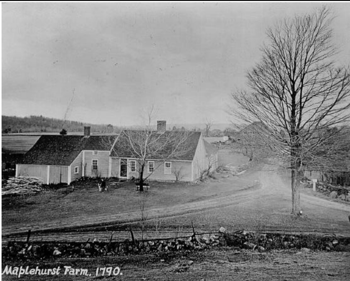
Maplehurst Farm, 1790.