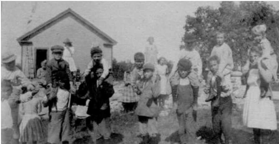
Photo caption— The Charge of the Light Brigade at the Schoolhouse Pond School

Clearly, the 1877 counterfeiters were not aware that East Thompson was not a lucky place for their kind. They were discovered as well.