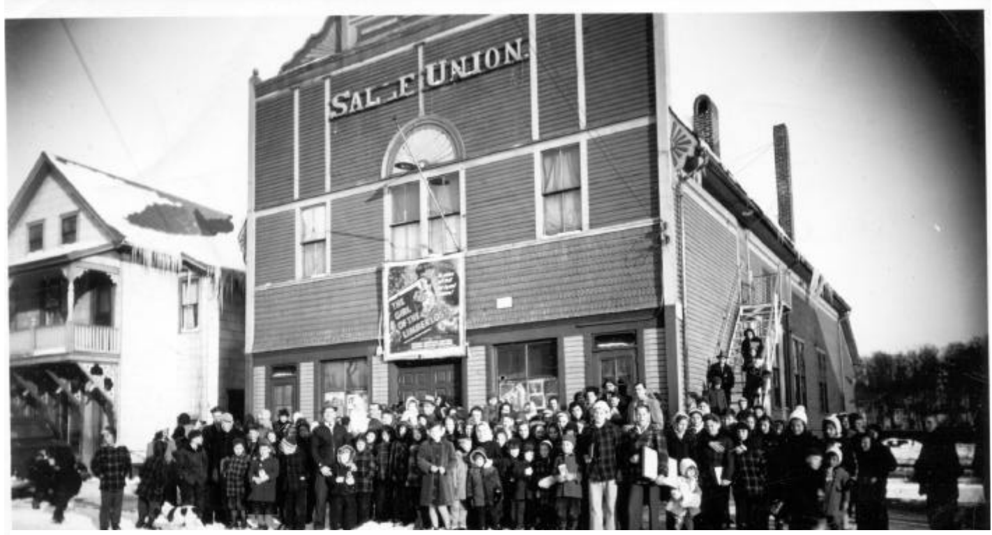
Textile Workers Union Christmas party for children, 1945, at Salle Union, Main St., No. Grosvenordale. "Union Hall" was the town's theatre and was running "The Girl of the Limber Lost".